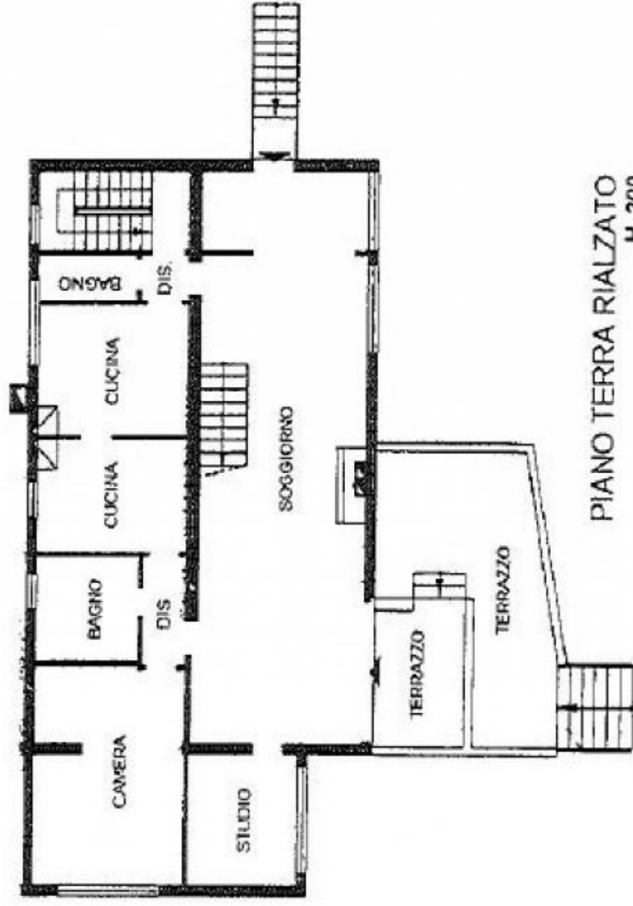
PIANO TERRA RIALZATO H. 300